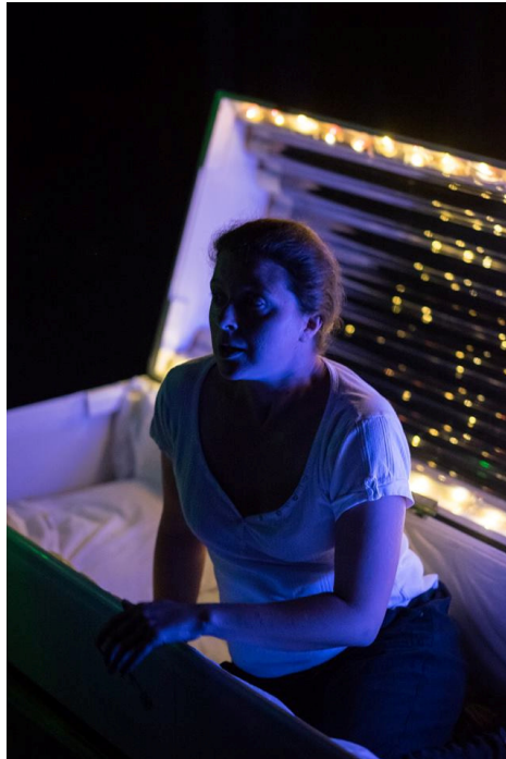
New Cryo Release Patient